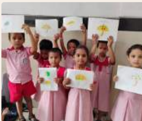
BHANDUP TANK ROAD MPS