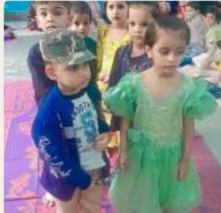
SHIVAJI NAGAR MARATHI