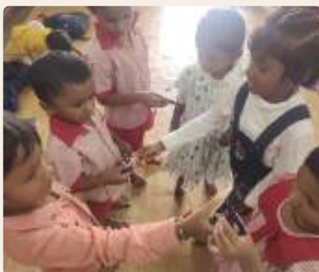
SOUTH SEWREE MPS