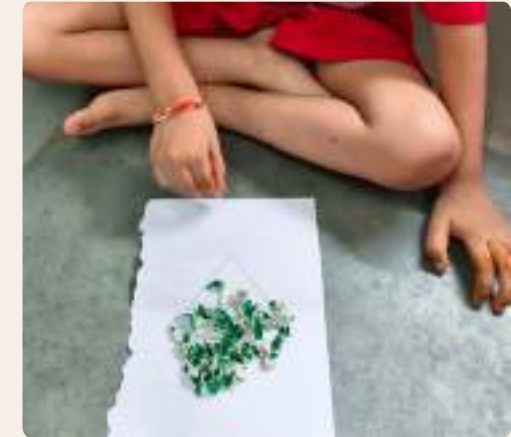
SAINATH NAGAR MARATHI