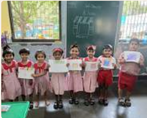
BARVE NAGAR MPS

In September 2025 , the children of our preschool joyfully celebrated Teachers' Day and Navratri with great enthusiasm. Guided by the NEP 2020 framework , they engaged in creative art and craft activities that encouraged imagination , cultural awareness, and fine motor skills. Through making colourful decorations, festive crafts , and expressive artworks, the children not only honoured their teachers and traditions but also learned the values of respect, creativity, and togetherness in a playful and meaningful way.