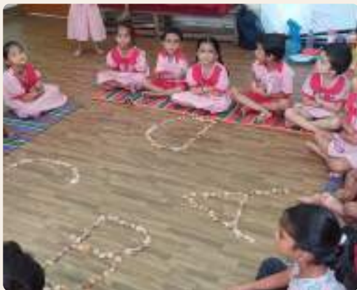
KAWALE MATH BANGANGA