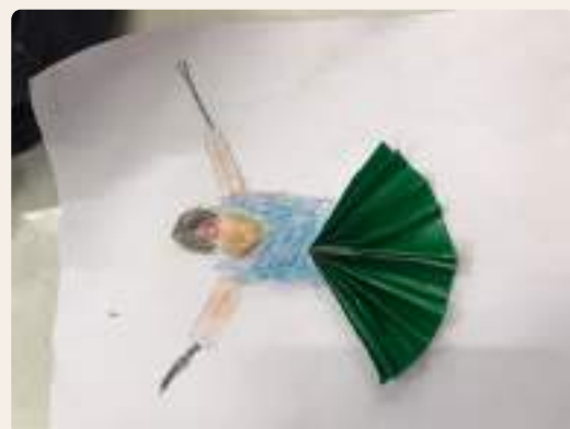
SHASTRI NAGAR MPS