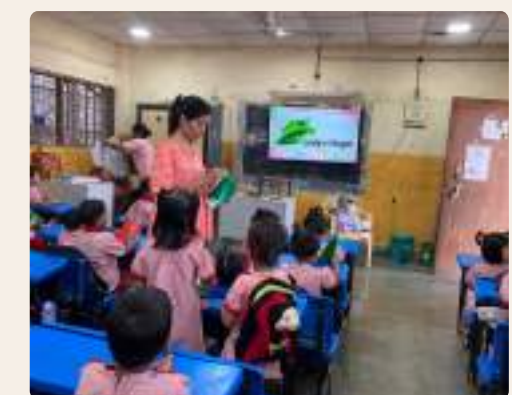
NEHARU NAGAR KANJUR