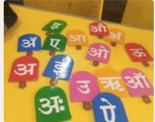
P K ROAD MPS