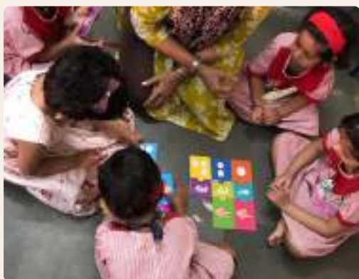
TRIVENI SANGAM MPS

In September 2025 , the children of our preschool joyfully celebrated Teachers' Day and Navratri with great enthusiasm. Guided by the NEP 2020 framework, they engaged in creative art and craft activities that encouraged imagination, cultural awareness, and fine motor skills . Through making colourful decorations , festive crafts , and expressive artworks, the children not only honoured their teachers and traditions but also learned the values of respect, creativity, and togetherness in a playful and meaningful way.