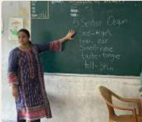
SAINATH NAGAR MPS