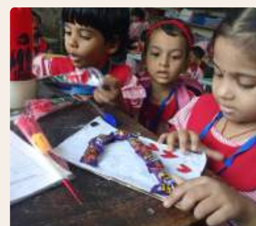
MOHILI VILLGE MPS