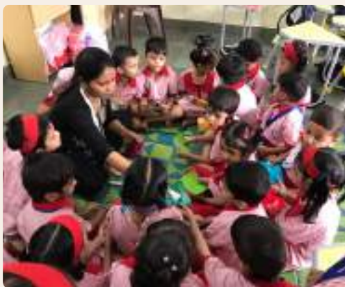
NEHARU NAGAR MPS