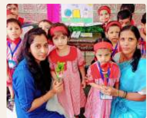
S G BARVE MARG MPS