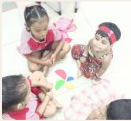
SITARAM MILL MARATHI