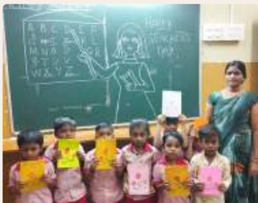
JUHU GANDHIGRAM MPS