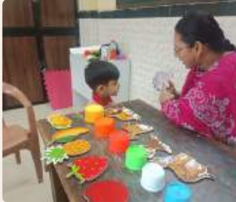
SAINATH NAGAR MPS