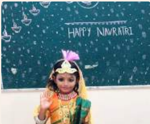
NEHARU NAGAR MPS