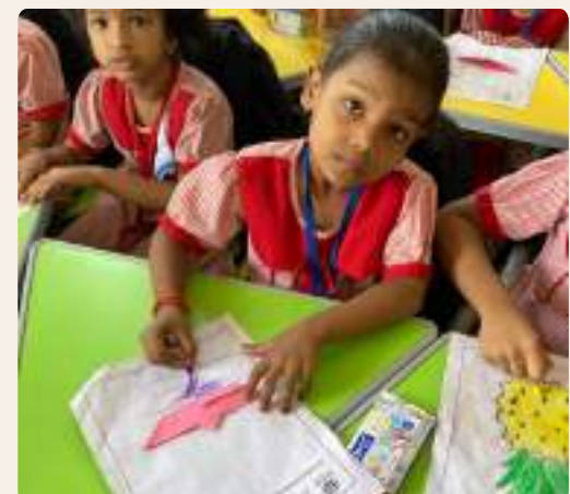
MOHILI VILLGE MPS