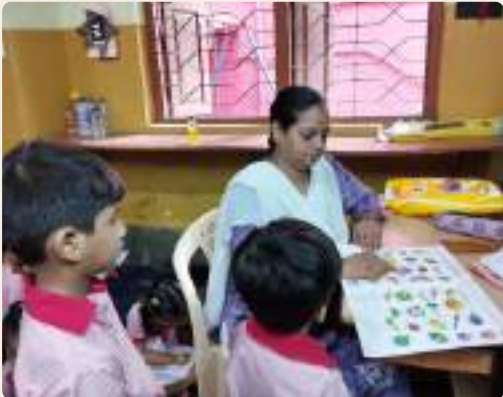
JUHU GANDHIGRAM MPS