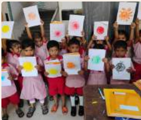
BHANDUP TANK ROAD MPS