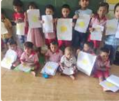
SOUTH SEWREE MPS