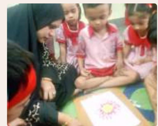
S G BARVE MARG MPS