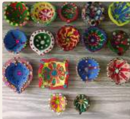
SITARAM MILL MARATHI