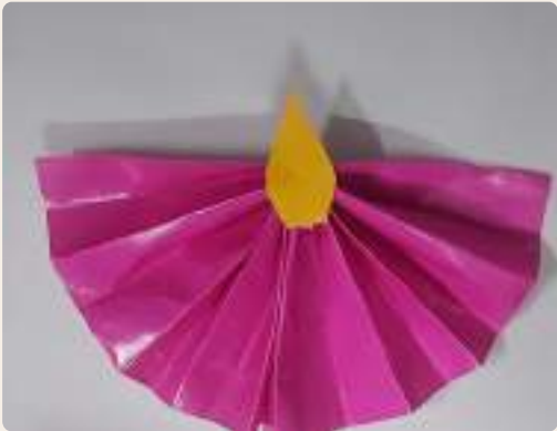
TRIVENI SANGAM MPS

In the month of October, our preschool children joyfully celebrated Gandhi Jayanti, Navratri and Deepavali with songs, stories and festive activities. They expressed their creativity through art, dance and cultural sharing. Along with celebrations, this month also brought exam time, where children confidently displayed their learning and understanding, making October a beautiful blend of celebration, culture and academic readiness.