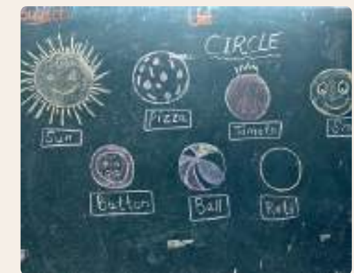
NEHARU NAGAR KANJUR