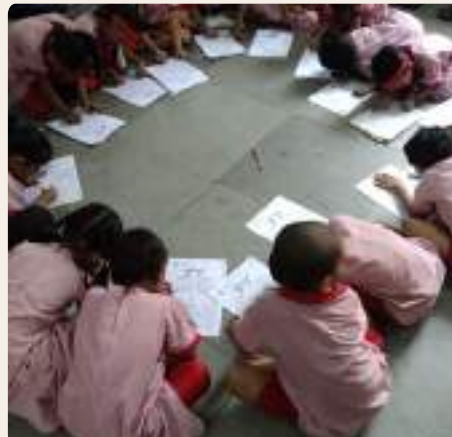
SHIVAJI NAGAR MARATHI