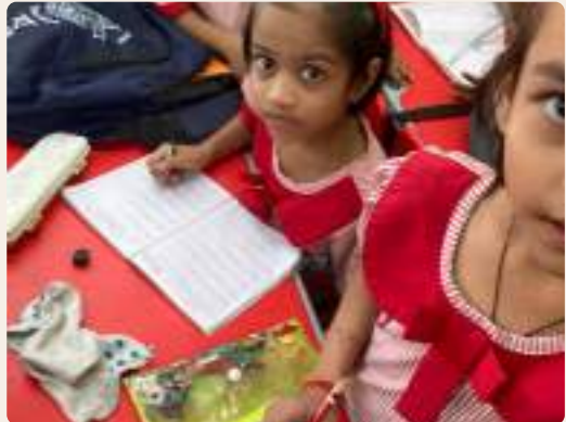
SHASTRI NAGAR MPS