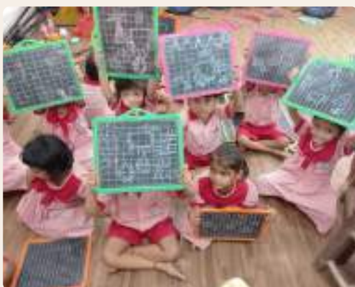
KAWALE MATH BANGANGA