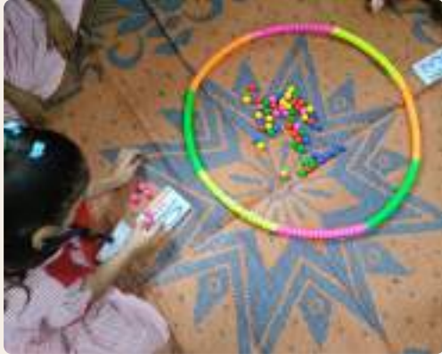
BARVE NAGAR MPS

In the month of October, our preschool children joyfully celebrated Gandhi Jayanti, Navratri and Deepavali with songs, stories and festive activities. They expressed their creativity through art, dance and cultural sharing. Along with celebrations, this month also brought exam time, where children confidently displayed their learning and understanding, making October a beautiful blend of celebration, culture and academic readiness.