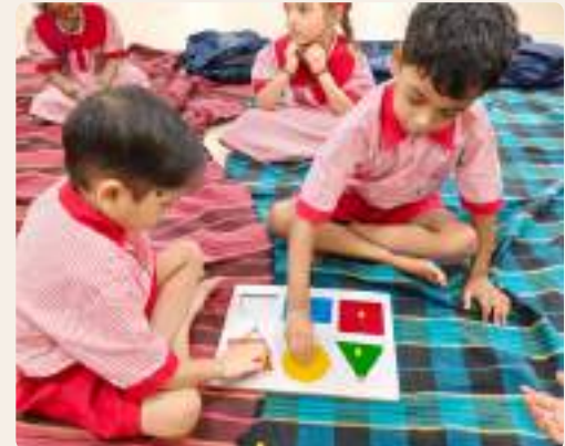
P K ROAD MPS