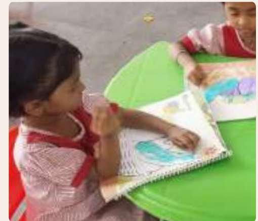
SAINATH NAGAR MARATHI