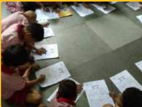
RAMABAI HINDI BALWADI