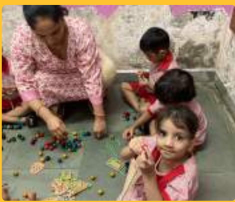
TILAK NAGAR MPS