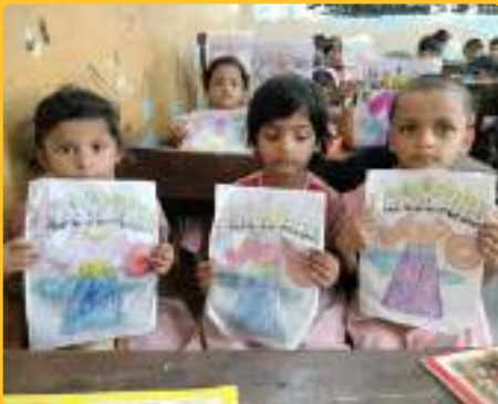
JUHU GANDHIGRAM MPS