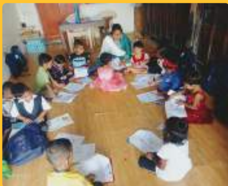
SOUTH SEWREE MPS