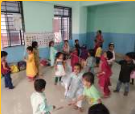
SITARAM MILL COMPOUND