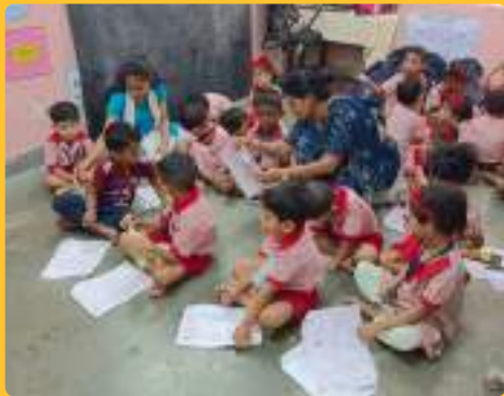
TRIVENI SANGAM MPS

Bhavyata Foundation's teachers, working across 20 schools and 37 classes in Mumbai , guided students through their first-term exams and integrated play-based activities to develop gross motor skills . The festive celebrations of Navratri and Deepawali added excitement, offering students a rich blend of academic achievement and cultural immersion, making learning enjoyable and memorable.