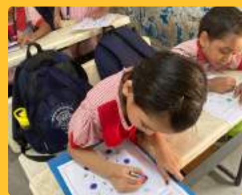
ANAND NAGAR MPS

Bhavyata Foundation's teachers, working across 20 schools and 37 classes in Mumbai , guided students through their first-term exams and integrated play-based activities to develop gross motor skills . The festive celebrations of Navratri and Deepawali added excitement, offering students a rich blend of academic achievement and cultural immersion, making learning enjoyable and memorable.