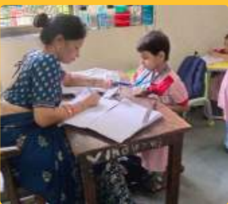
SEWREE CROSS ROAD MPS