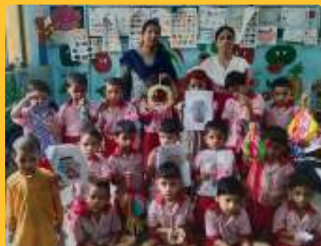
SHIVAJI NAGAR BALWADI