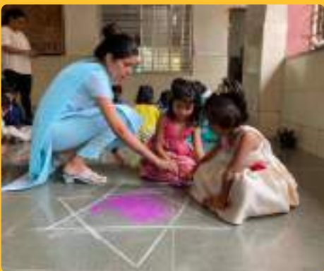
SHASTRI NAGAR MPS