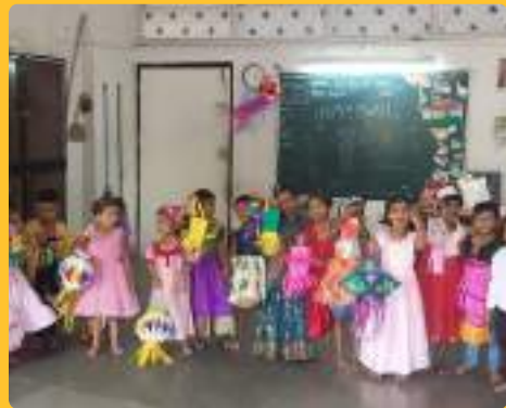
SAINATH NAGAR BALWADI