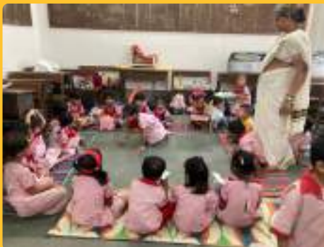
KAWALE MATH BALWADI