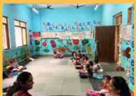
SHIVAJI NAGAR BALWADI