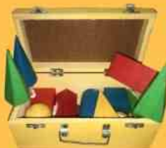
3 D SHAPES