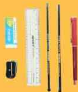
PENS AND RULER