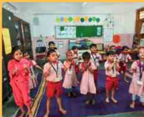
TRIVENI SANGAM MPS

Preschools started the academic year with impressive enrollment numbers. The children quickly engaged in the learning process, marking a promising beginning to the year. Across 20 schools and 37 classes in Mumbai, our teachers were diligent in conducting revisions and helping children acclimate to school life again after the break.