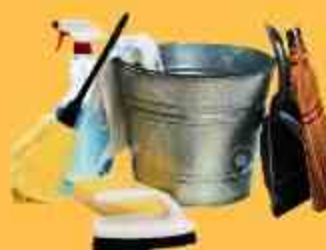
BROOM DUST PAN