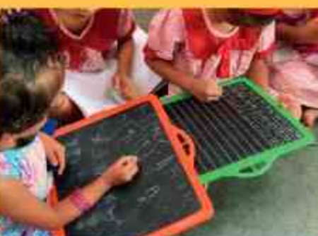
KAWALE MATH BALWADI