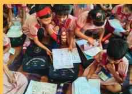
SHASTRI NAGAR MPS