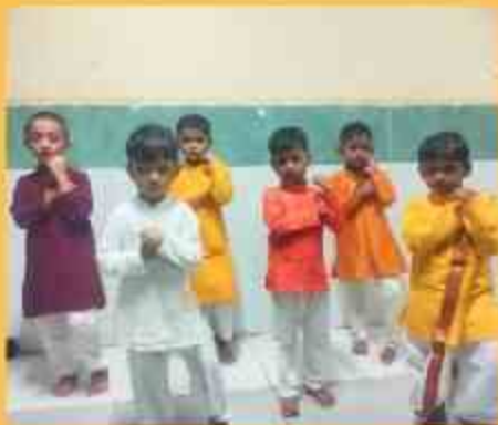
JUHU GANDHIGRAM MPS

Play and Learn - to enhance gross motor skills