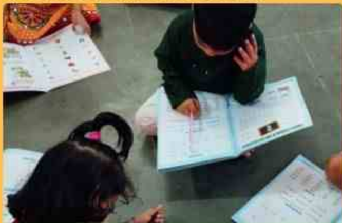
Sainath Nagar Marathi

In July, Bhavyata Foundation's balwadi teachers conducted interactive sessions with students, incorporating rhymes, toys, and circle time activities. These engaging methods helped foster a positive learning environment, encouraging active participation from the children. By utilizing play-based learning, the teachers enhanced the students' social, cognitive, and motor skills effectively.