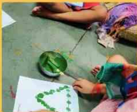
ANAND NAGAR MPS

Preschools started the academic year with impressive enrollment numbers. The children quickly engaged in the learning process, marking a promising beginning to the year. Across 20 schools and 37 classes in Mumbai, our teachers were diligent in conducting revisions and helping children acclimate to school life again after the break.