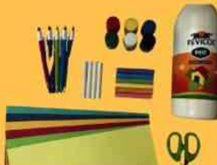
CHALKS AND PENCILS