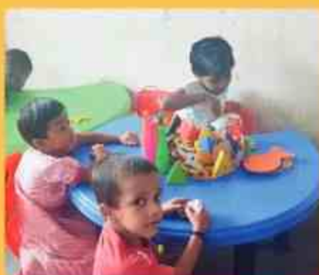
SITARAM MILL MARATHI BALWADI