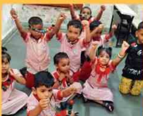
TILAK NAGAR MPS