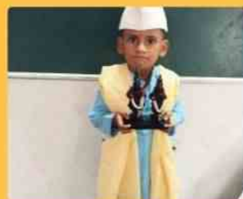
SAINATH NAGAR BALWADI