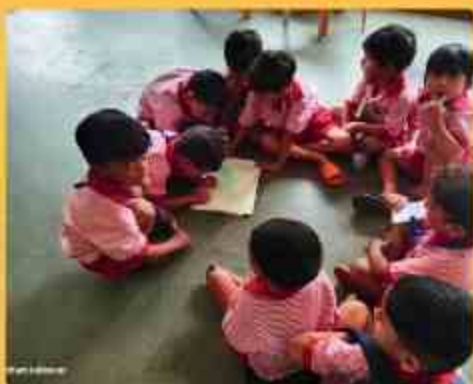
LIMBONI BAG MPS