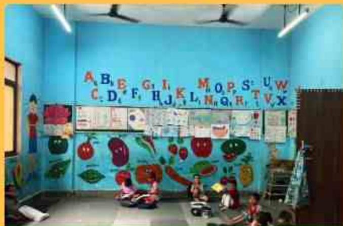
Shivaji Nagar Marathi