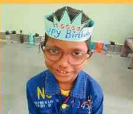
SEWREE CROSS ROAD MPS