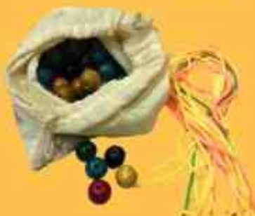
LACE & BEADS