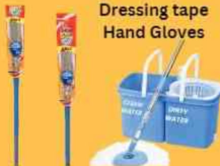
MOP AND BUCKET