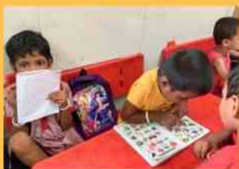
RAMABAI HINDI BALWADI