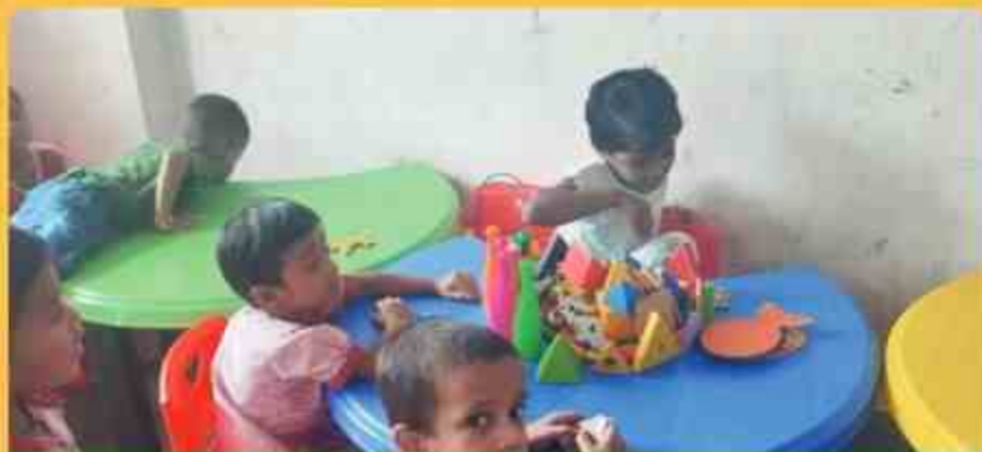
Sitaram Mill Marathi