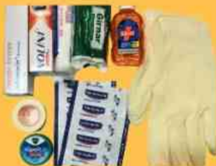
FIRST AID BOX

All-purpose cleaner Broom and dustpan Mop and bucket Duster Cloths