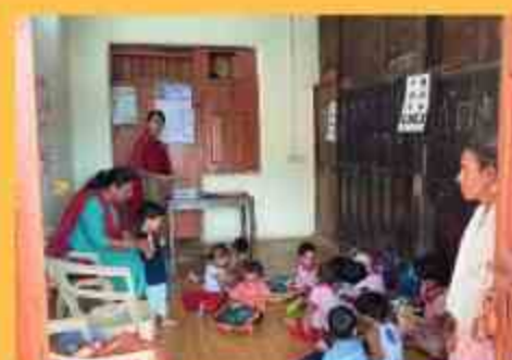
SOUTH SEWREE MPS