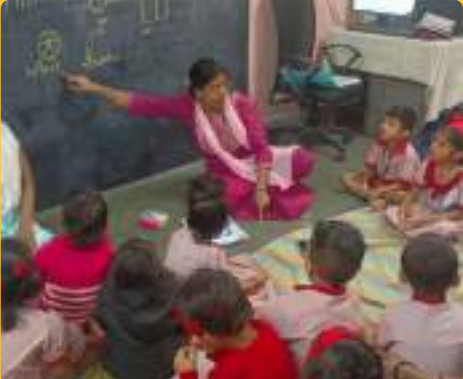
TRIVENI SANGAM MPS

In January 25, our students across 20 preschools engaged in a variety of creative and skill-enhancing activities. They solved worksheets, created boats with craft paper, folded and colored trees, and explored gross motor skills through jumping in circles, ball throwing, and playing basketball. Fine motor skills were enhanced with clay shape-making. The children also learned about body parts and practiced vegetable sorting, reinforcing both their cognitive and sensory development. The day was further enriched by celebrating Republic Day and Makar Sankranti. The children participated in patriotic activities and made kites, fostering a sense of national pride and cultural appreciation. This diverse set of activities promoted holistic development, learning, and enjoyment.