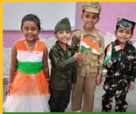
TILAK NAGAR MPS