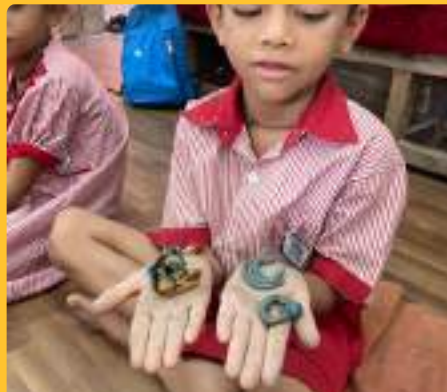
KAWALE MATH BALWADI