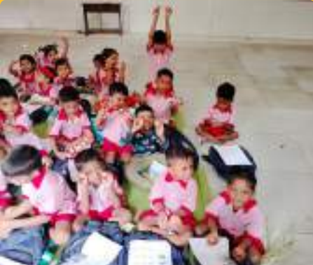
JUHU GANDHIGRAM MPS