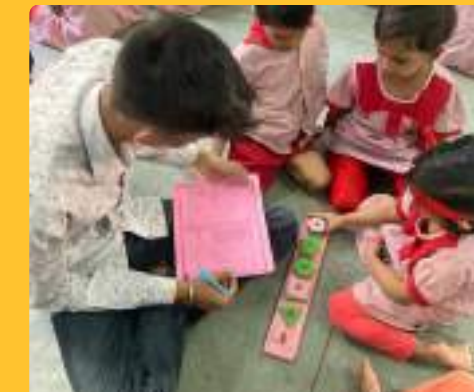
SHIVAJI NAGAR BALWADI