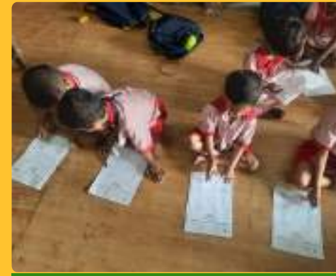
SOUTH SEWREE MPS