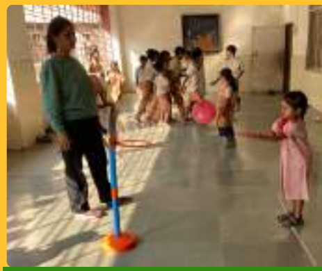
SHASTRI NAGAR MPS