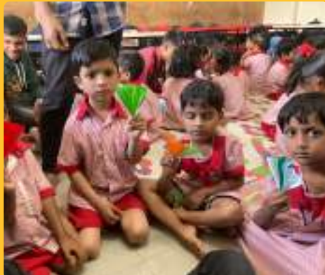
RAMABAI HINDI BALWADI