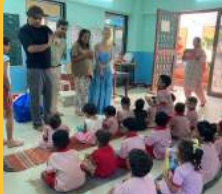
SITARAM MILL COMPOUND