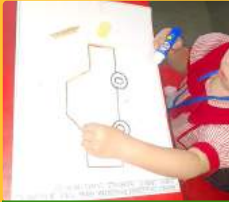
SEWREE CROSS ROAD MPS