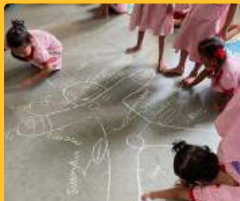
LIMBONI BAG MPS