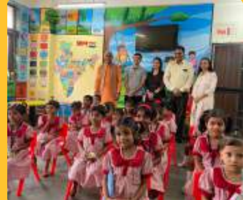
SAINATH NAGAR BALWADI