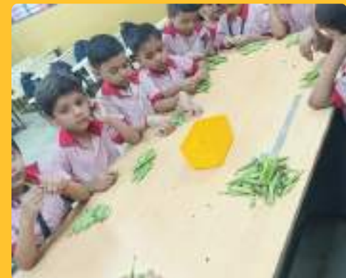
ANAND NAGAR MPS

In January 25 , our students across 20 preschools engaged in a variety of creative and skill-enhancing activities. They solved worksheets, created boats with craft paper, folded and colored trees, and explored gross motor skills through jumping in circles, ball throwing, and playing basketball . Fine motor skills were enhanced with clay shape-making . The children also learned about body parts and practiced vegetable sorting , reinforcing both their cognitive and sensory development . The day was further enriched by celebrating Republic Day and Makar Sankranti . The children participated in patriotic activities and made kites, fostering a sense of national pride and cultural appreciation. This diverse set of activities promoted holistic development, learning, and enjoyment.