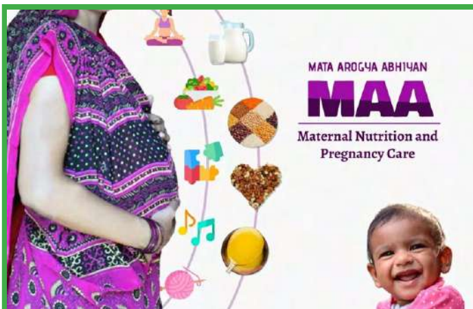
MAA Mata Arogya Abhiyan