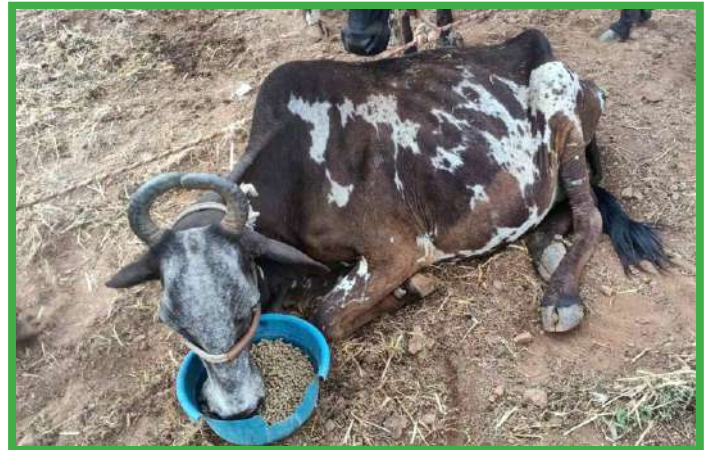
Samvardhan Breed Preservation