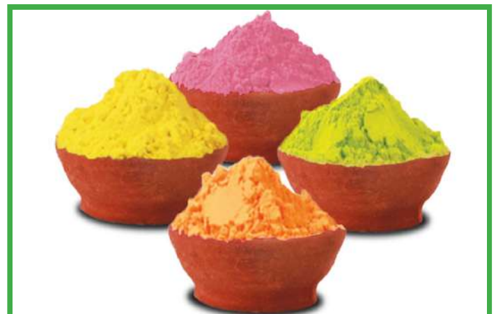
Celebrating Culture Holi Colors