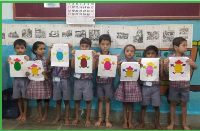
Balvatika Preschool Education