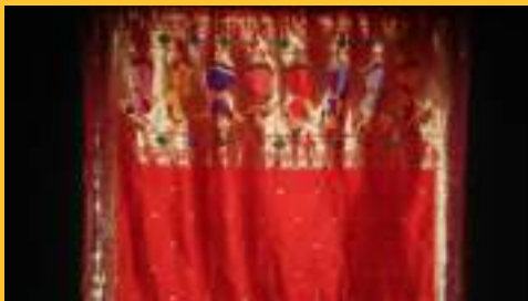
Rhapsody in Hues - An Ashtanyika-Inspired Ensemble