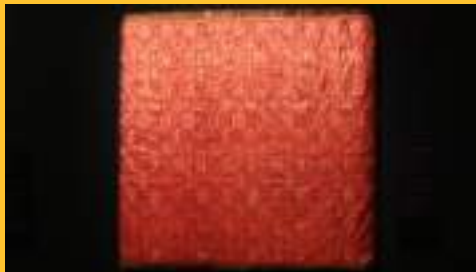
Patola - The Guru's Treasure Trove