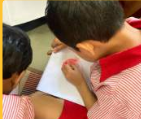
RAMABAI HINDI BALWADI