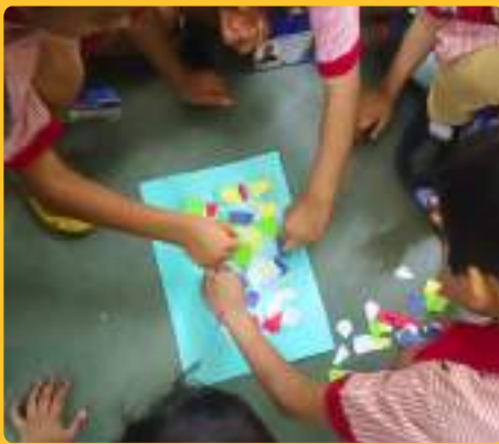
SEWREE CROSS ROAD MPS