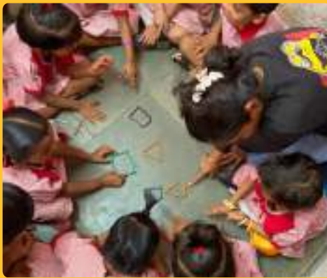
TILAK NAGAR MPS