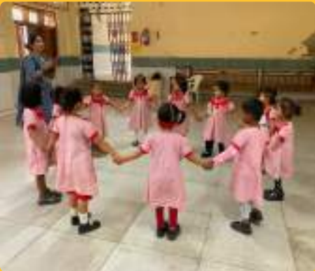
JUHU GANDHIGRAM MPS