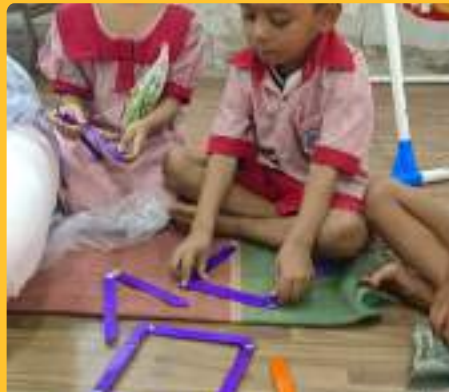
KAWALE MATH BALWADI