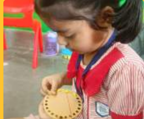
SAINATH NAGAR BALWADI