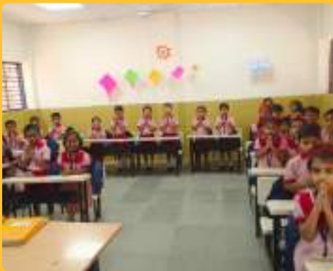
ANAND NAGAR MPS

In February 2025 , our preschool students engaged in activities like clay modeling, crafts, and coloring worksheets provided by Bhavyata Foundation . We celebrated Annual Day at Andheri MPS and Shastri Nagar MPS. Additionally, we conducted shapes and color recognition activities during the sessions, making the month fun and educational for the children.