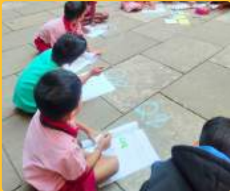
TRIVENI SANGAM MPS

In February 2025 , our preschool students engaged in activities like clay modeling, crafts, and coloring worksheets provided by Bhavyata Foundation . We celebrated Annual Day at Andheri MPS and Shastri Nagar MPS. Additionally, we conducted shapes and color recognition activities during the sessions, making the month fun and educational for the children.