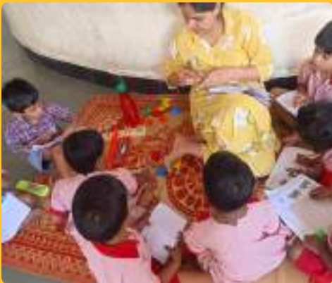
LIMBONI BAG MPS