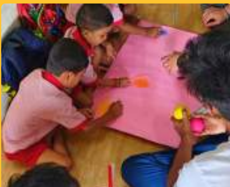
SOUTH SEWREE MPS