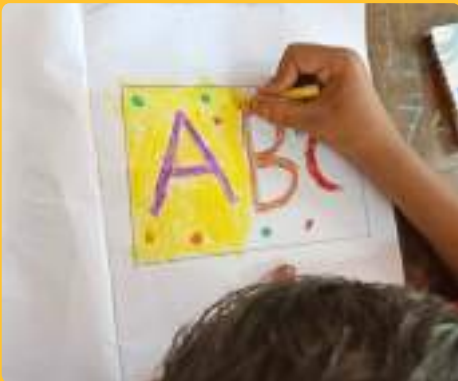
SHASTRI NAGAR MPS