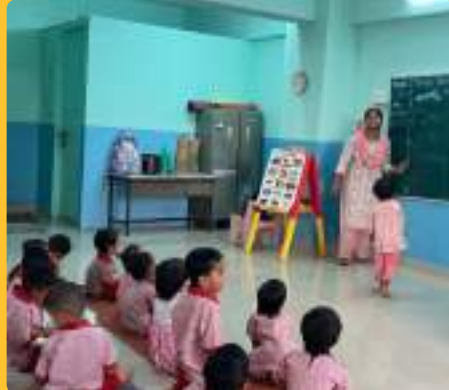
SITARAM MILL COMPOUND