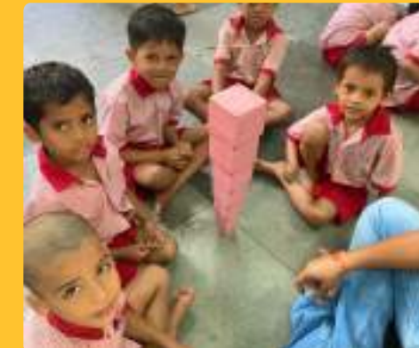
SHIVAJI NAGAR BALWADI