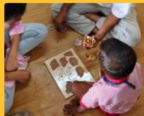
SOUTH SEWREE MPS