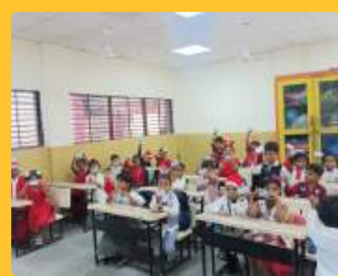
ANAND NAGAR MPS

On December 24 , our preschool children engaged in a variety of creative and skill-enhancing activities. They solved worksheets , created boats with craft paper , folded and colored trees , and explored gross motor skills through jumping in circles and ball throwing . Fine motor skills were enhanced with clay shape-making and a fun balloon-balancing activity , fostering development and enjoyment.