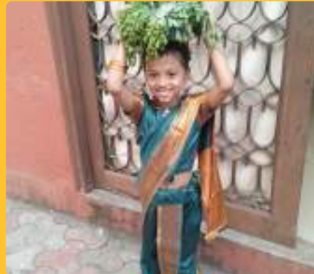
SITARAM MILL COMPOUND