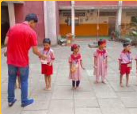
TRIVENI SANGAM MPS

On December 24 , our preschool children engaged in a variety of creative and skill-enhancing activities. They solved worksheets , created boats with craft paper , folded and colored trees , and explored gross motor skills through jumping in circles and ball throwing . Fine motor skills were enhanced with clay shape-making and a fun balloon-balancing activity , fostering development and enjoyment.