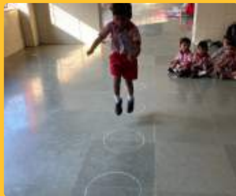
SHASTRI NAGAR MPS