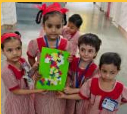
SEWREE CROSS ROAD MPS