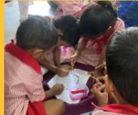
SAINATH NAGAR BALWADI