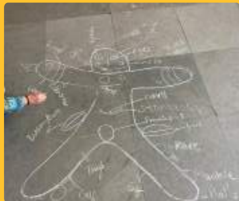
LIMBONI BAG MPS