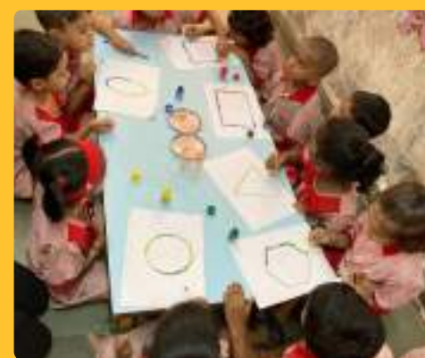
TILAK NAGAR MPS