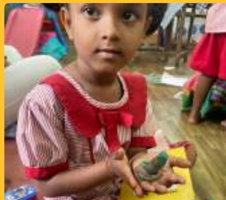
KAWALE MATH BALWADI