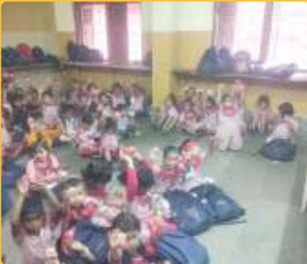
JUHU GANDHIGRAM MPS