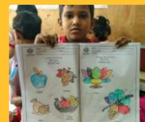
SHIVAJI NAGAR BALWADI