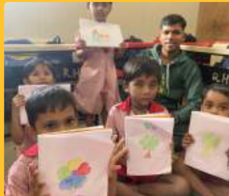
RAMABAI HINDI BALWADI